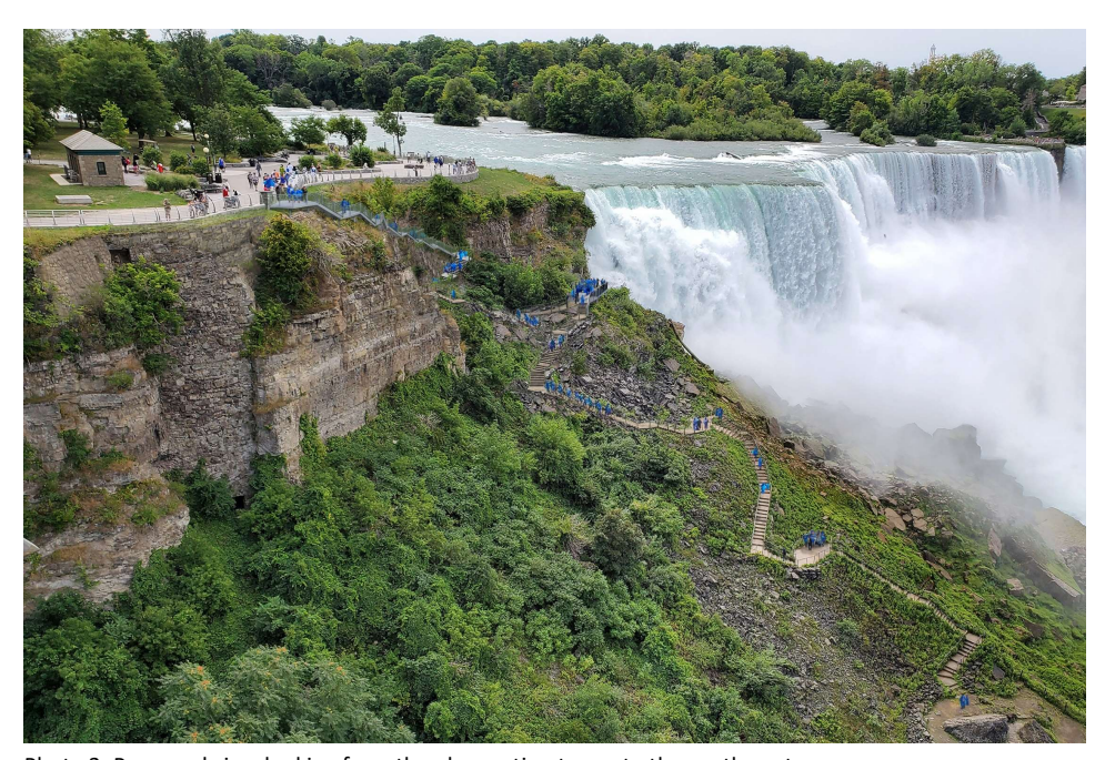
Photo 2: Proposed view looking from the observation tower to the south-east