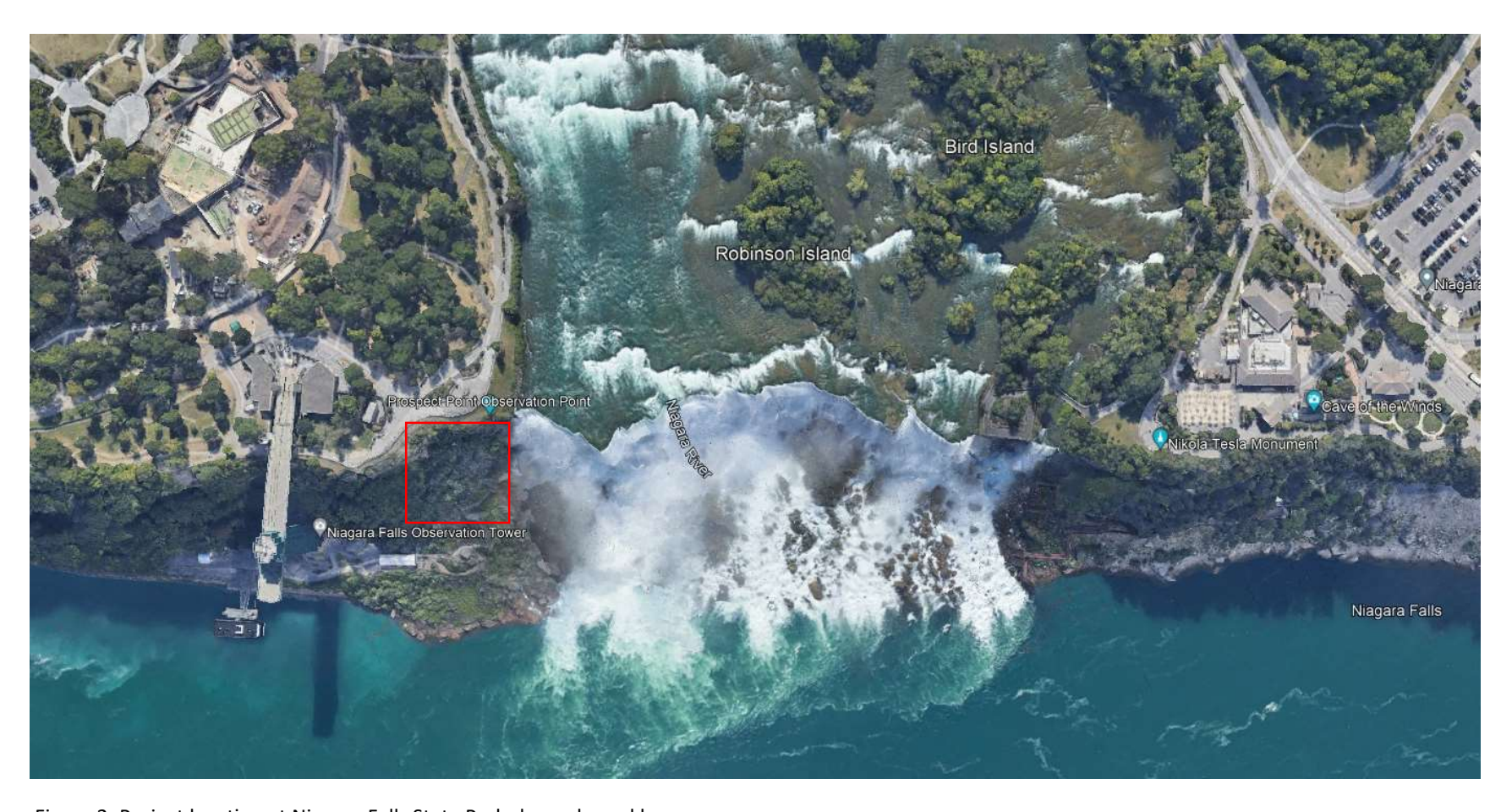
Figure 2: Project location at Niagara Falls State Park shown by red box